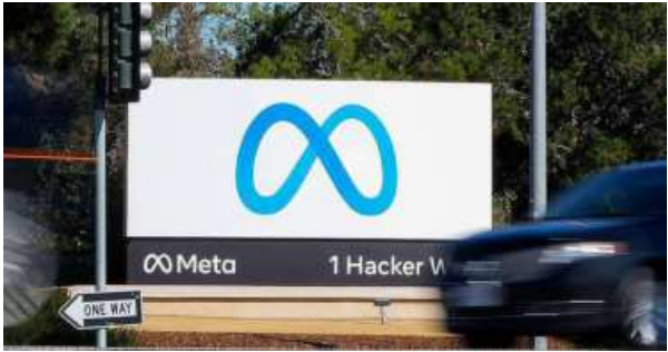
THUMBS DOWN. In Q3, Meta saw its profits fall to $4.4 billion, a 52 per cent decrease year-over-year