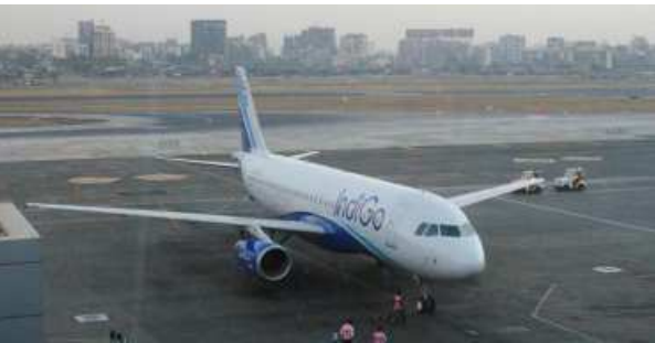
PLAN B. IndiGo is looking at wet leasing of aircraft

IndiGo has grounded 30 aircraft due to global supply-chain disruptions. It amounts to around 10 per cent of its fleet. To avoid disruption, the airline is looking at wet leasing of aircraft. The low-cost carrier said the aviation industry is facing significant supply-chain disruptions globally. “While it is our immediate priority to deploy adequate capacity to serve our customers, we are actively engaged with our OEM partners to work on mitigation measures that should ensure the continuity of our network and operations. As