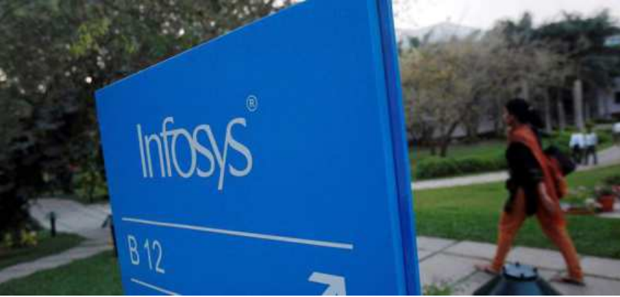
RAY OF HOPE. Infosys saw its large deal total contract value rise from $1.7 b in Q1 to $2.7 b in Q2

The next few quarters will see a moderation in large deals by IT firms as uncertainty looms over slowdown in Western economies, say analysts. Firms are seeing clients prioritising deals that offer quicker wins, as indicated by the leadership in their Q2 commentary. For the quarter ended September 30, IT majors reported healthy deal wins. Infosys saw its large deal total contract value rise from $1.7 billion in Q1 to $2.7 billion in Q2. Wipro, too, said it saw a 24 per cent a year-on-year rise in deals at $725 million. HCL Tech’s new deals rose 16 per cent quarter-on-quarter at $2.38 billion. Tech Mahindra, however, saw a 10.72 per cent